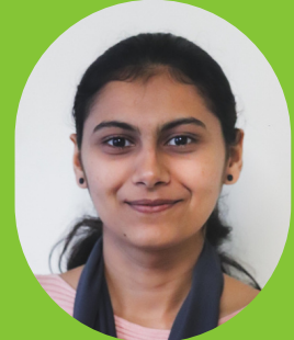
ShahanaTK MSc in DATA ANALYTICS with specialization in BioAI